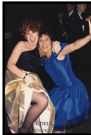
Pictured left, a few sisters at the 25 th anniversary celebration. Rocking the classic and times 80's chic style.