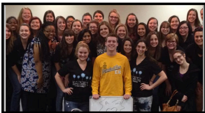
Congratulations to the winner of the Sig Delt's Treat, Sigma Nu.

Sig Delt Dude Pageant, our chapter decided to hold multiple fundraising events and a pageant Fall semester, while holding a larger awareness event Spring semester.