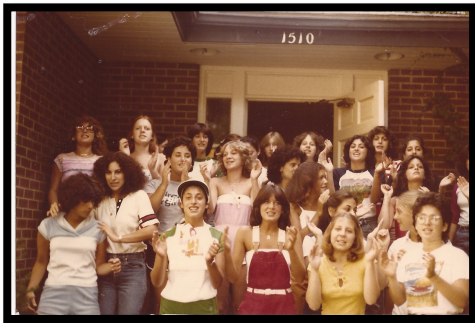
This picture from 1979 shows the Ladies of our Chapter doing our cheer. Notice that the current house address is seen in the background. 1510 Fredonia was grooving in the 70's.