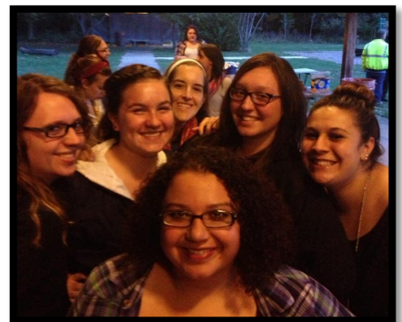
Some Ladies enjoying the bonfire and s'mores.

The Date Party event featured for the fall semester was "Torched." Held at a Peoria park, the night included a bonfire as well as warm hot chocolate and s'mores for the cold October night. Both new members and actives celebrated this exciting event to kick off the semester's fall events. Additionally members sported the date party favors of themed quarter zips and t-shirts.