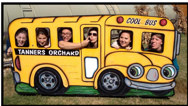
New members as well as actives enjoying the sunny fall day at Tanner's Orchard.