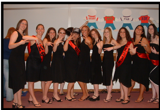
Some "Ghetto" escorts at the Sig Delt Dude pageant. Circa 2004.

Just last year our chapter, Alpha Upsilon, celebrated its 50 th anniversary. We would like to commemorate all those memories as well as the news ones made today. By featuring some of those moments here we hope to remember where our chapter has been as well as where we are going.