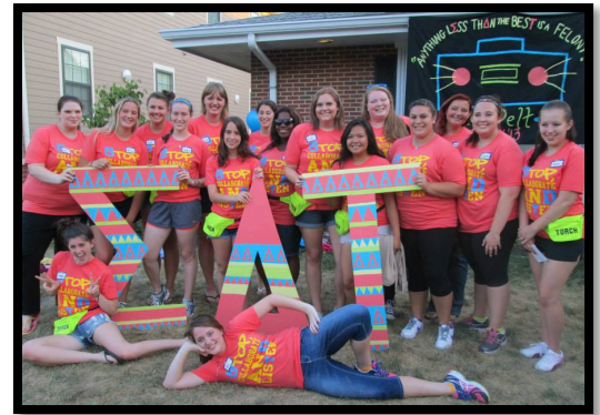
The Oh So Wonderful Pledge Class of Fall 2013 posing with bid day letters.

The new members were given their Pearls as well as a rockin' bid day styled t-shirt and the additional favor of a neon fanny pack. After an exhausting final day of recruitment, the day ended happily as these Ladies found their hearts drawn to our chapter. Welcome Home!