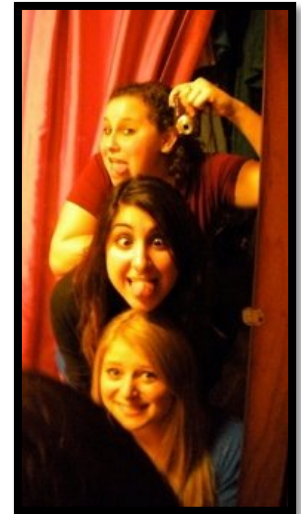
Some very new alumnae during an interesting freshman year.

Looking to contribute a photo? Send us on at the contact information listed below.