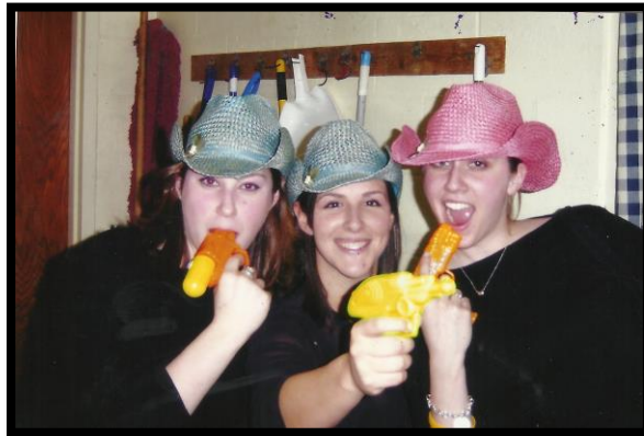
Some oh-so classy Ladies of Sigma Delta Tau (pictured right) at a 2005 Spring Date Party.