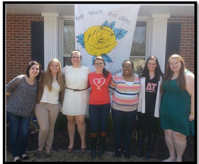
A few of the Alumnae attendees with the Alumnae Chair hosts celebrating Sigma Delta Tau's Founder's Day.

Additionally, Alumnae posed for pictures in front of the new banner created specifically for Alumnae events. Sadly, all good things have to come to an end; and, as guests started to depart, they wished nothing but luck on the Chapter and showed enthusiasm to return back to their home away from home soon.