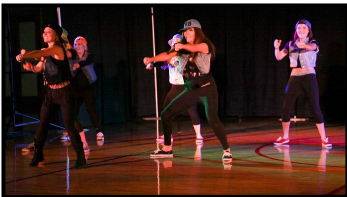
The winners of Bradley University's First Annual PCAA's Best Dance Crew, Gamma Phi Beta.

As the night of dancing began, each performance was judged based on attention to guidelines, difficulty, creativity, and expression, group execution and synchronization, and overall impression. The final winner of