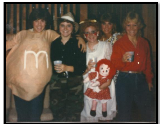
Here is some photographic proof that Halloween was just as ridiculous in 1984 as it is today.