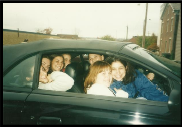
This wild group of 1997 New Members (pictured left) seem to be pulling some kind of Clown Car circus act.

Looking to contribute a photo? Send us one at the contact information listed below.