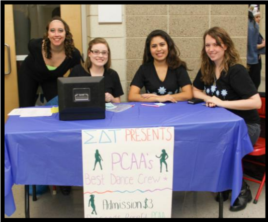
Volunteers selling tickets to the high demand of student.

This year, the Alpha Upsilon chapter hosted the first annual PCAA's (Prevent Child Abuse America) Best Dance Crew. The event featured a dance competition between sororities to raise awareness for all the philanthropies the campus' Greek life helps. It was the first serious dance competition held on campus and created a large amount of excitement for both attendees and participants.