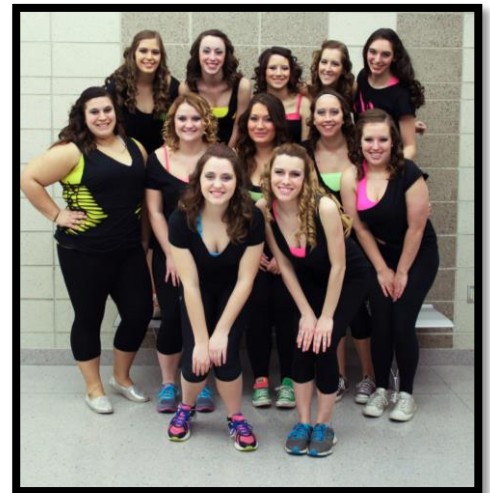
The Chapter's best dancers chosen to perform in the competition.

the competition was Gamma Phi Beta with a memorable and skilled dance catching both the attention of viewers and judged.